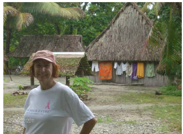
Hut on Fanning Island