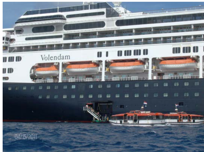
The Cruise Ship